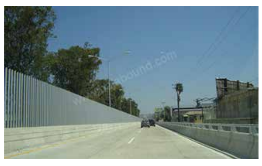
6. Continue for a few miles.