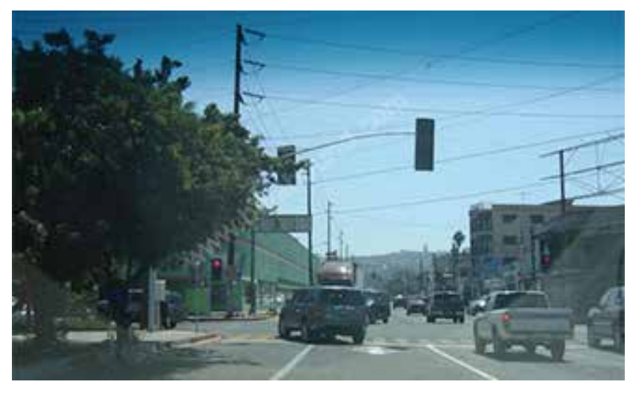
10. At the light is Calle Segunda. Smart & Final will be on your left, Mexitlán is across the street. Take a LEFT here.