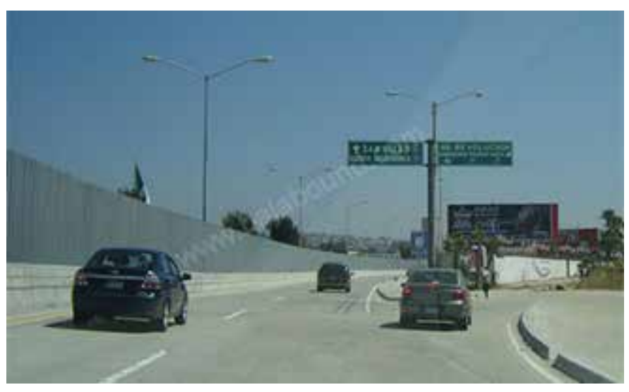
7. Watch for the SAN DIEGO/INTERSTATE 5 signs and continue to follow them.