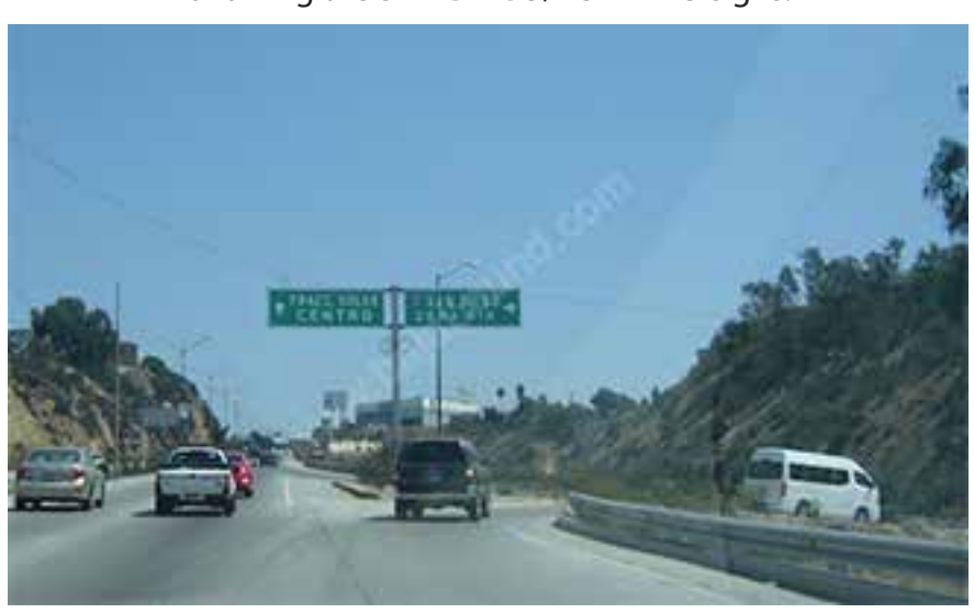
3. The exit is a loop to Avenida Internactional.