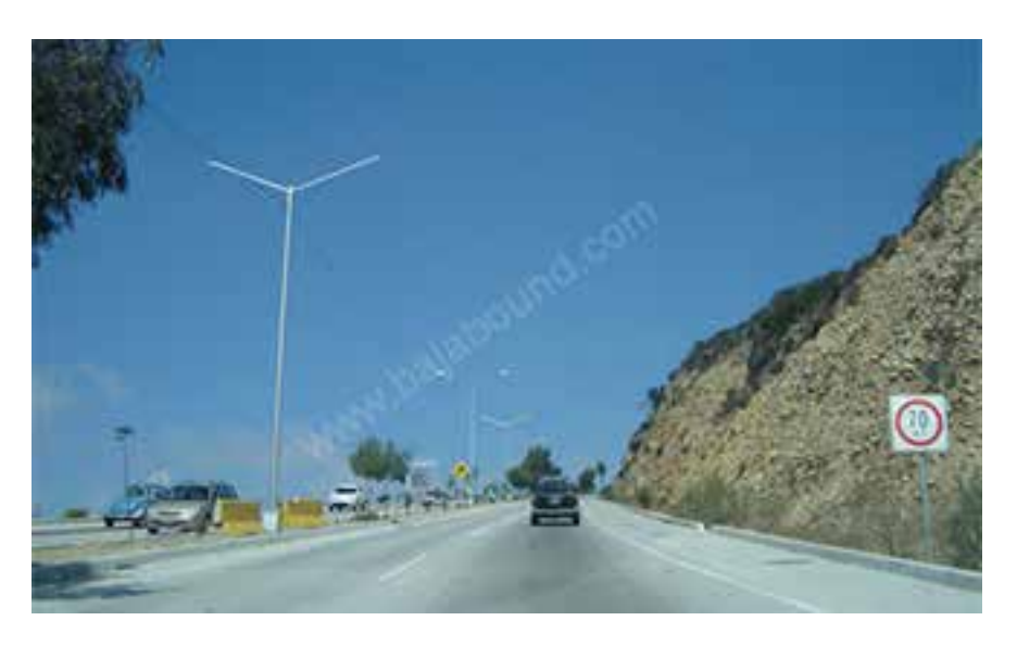
4. Continue up the hill.