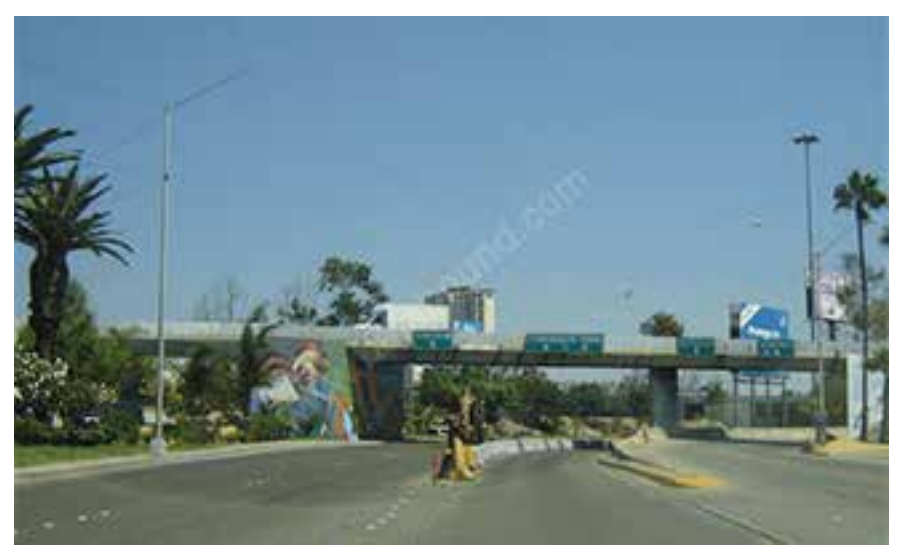
11. Continue straight to find the border lines. Keep left to get into the regular border lines and just to the right of the concrete divider to follow the COL. FEDERAL signs to the Fast Pass Lane or SENTRI lines. .