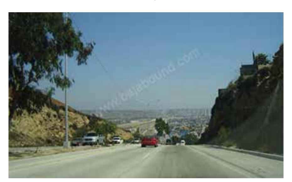
5. Now Avenida Internacional is paralleling the U.S./Mexico border.