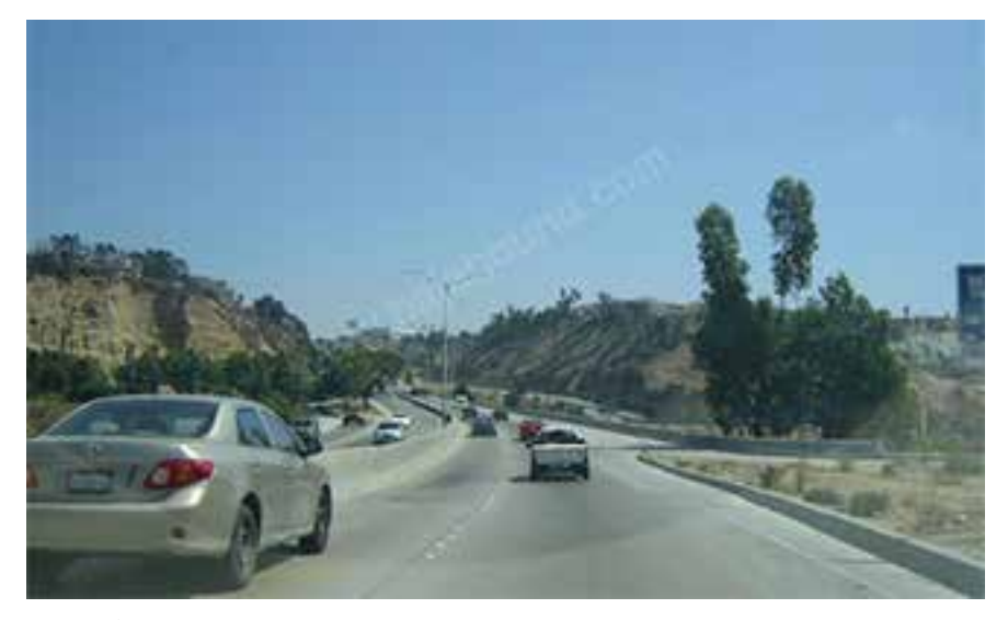
1. After going through the last toll booth at Playas de Tijuana, follow the SAN DIEGO/INTERSTATE 5 signs.